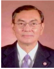
Dr. Tej Bunnag (ดร.เตช บุนนาค — ประธานกรรมการ)